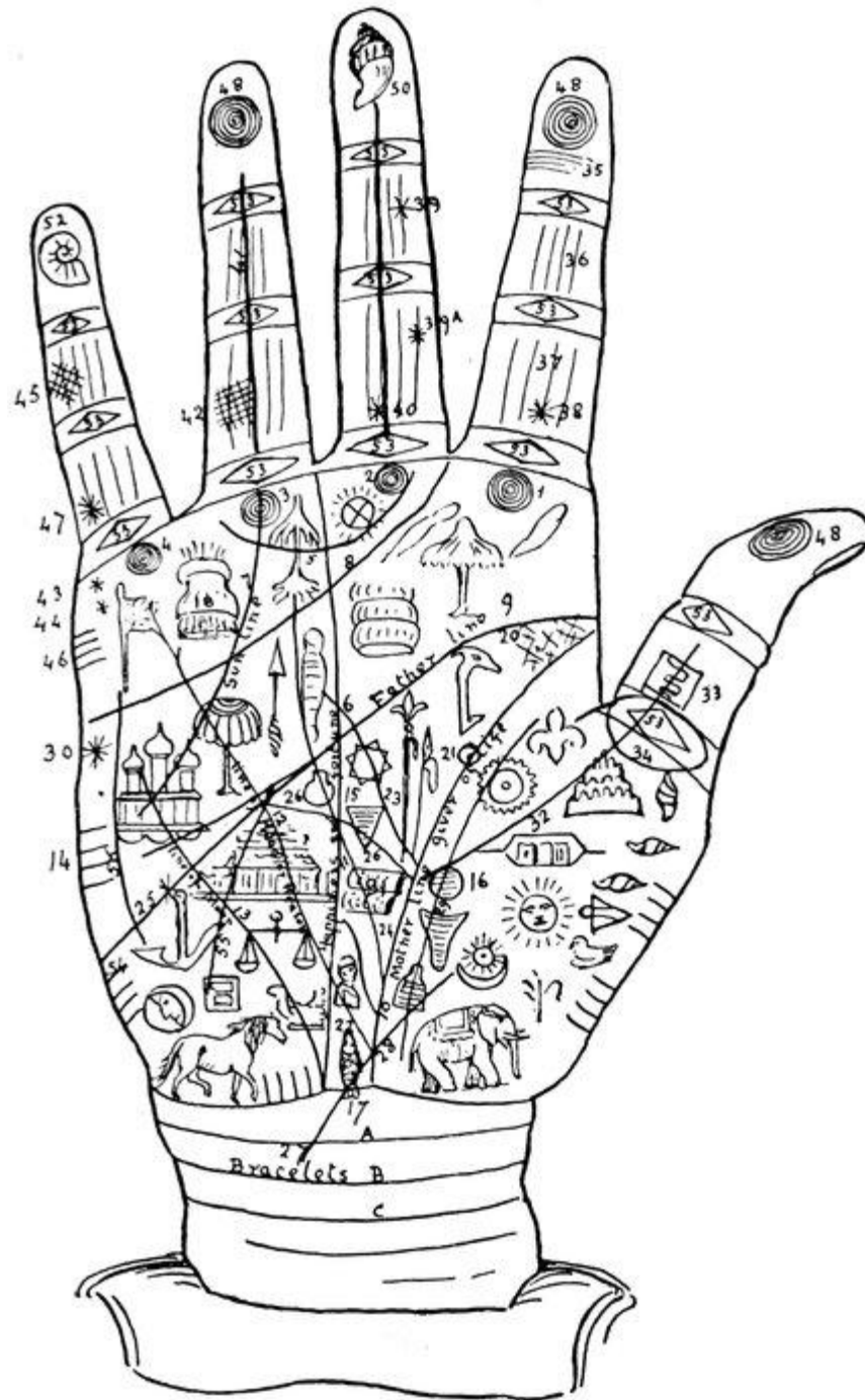
PLATE I.—THE REFERENCE HAND.