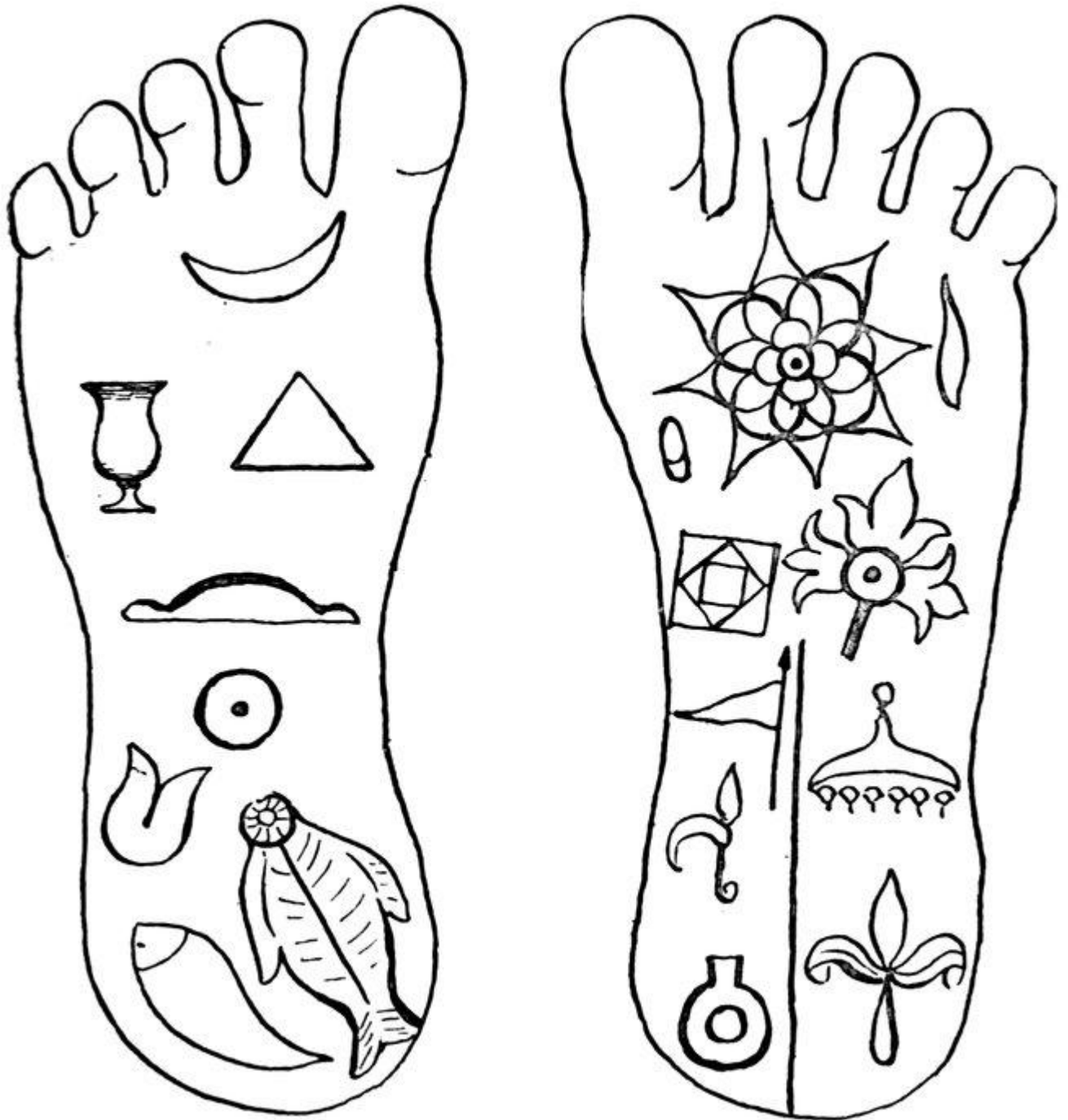
PLATE V.—ALLEGED MARKS ON THE FEET OF THE BENIGN BUDDHA.

Chiromancers generally teach that the first joints near the mount of the finger indicate the early age, the second, the flourishing state of manhood, and the last old age. But our opinion is that the planets shown by the nativity of the persons do, in their proper order, manifest their marks and characters whether for good or bad.