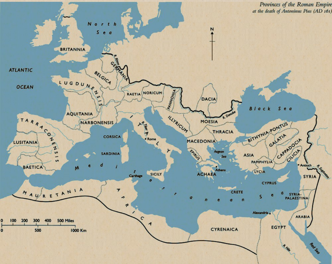
Provinces of the Roman Empire at the death of Antoninus Pius (AD 161)