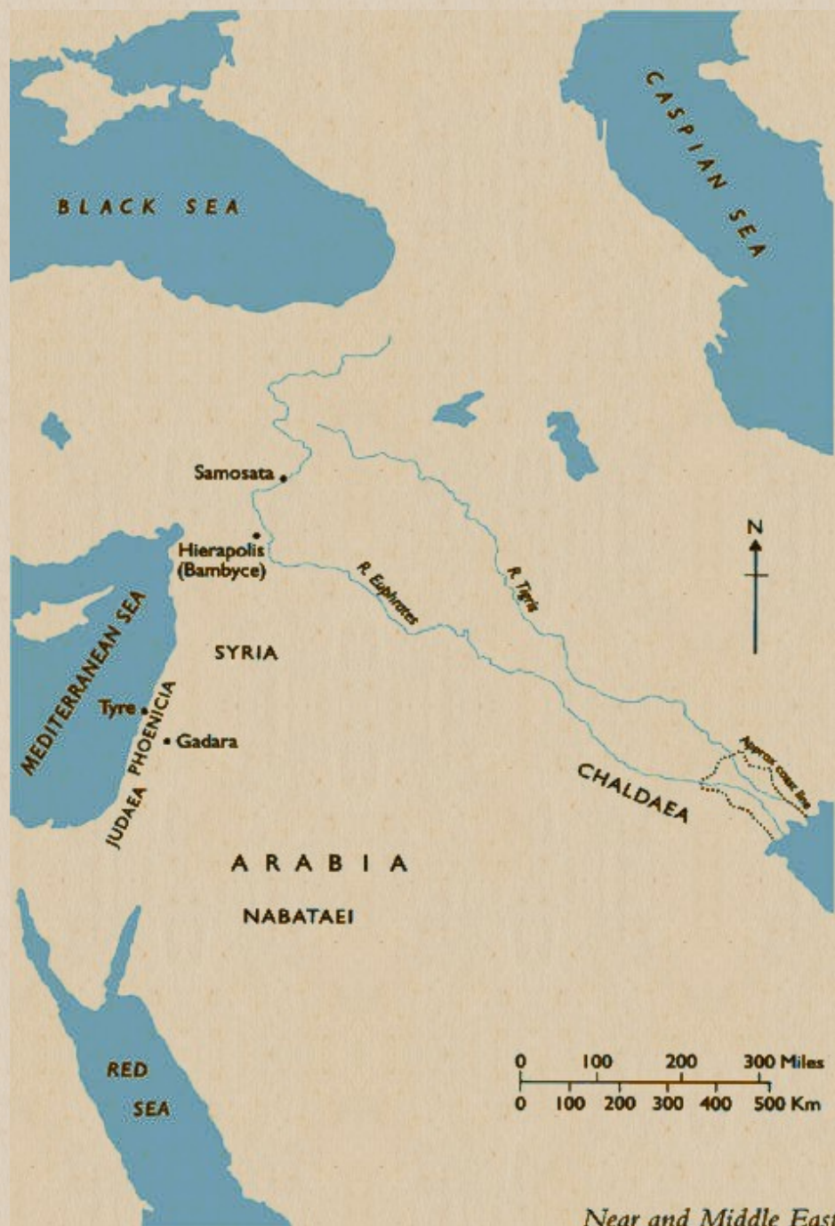
Near and Middle East